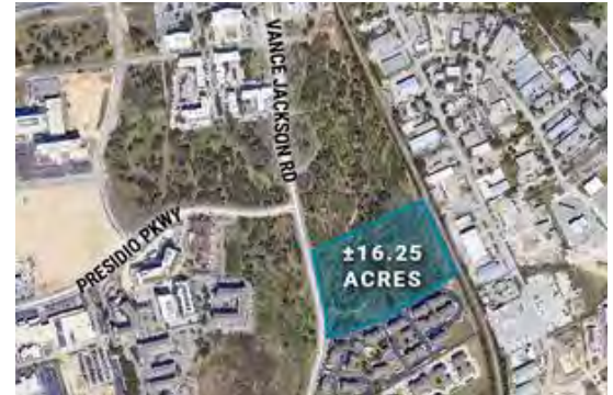
DOSCH MARSHALL REAL ESTATE

Alliance Residential purchased a 16.25-acre lot at Vance Jackson Road from Galleria Ventures Ltd for an undisclosed price Dec. 11, according to Reonomy data. The property was last assessed for $5.62 million, according to the Bexar County Appraisal District. The property is just southeast of the road's intersection with Presidio Parkway and directly north of the West Oaks Luxury Apartments at 14838 Vance Jackson Road.