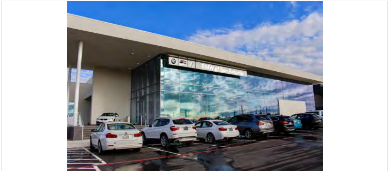
Principle BMW of San Antonio